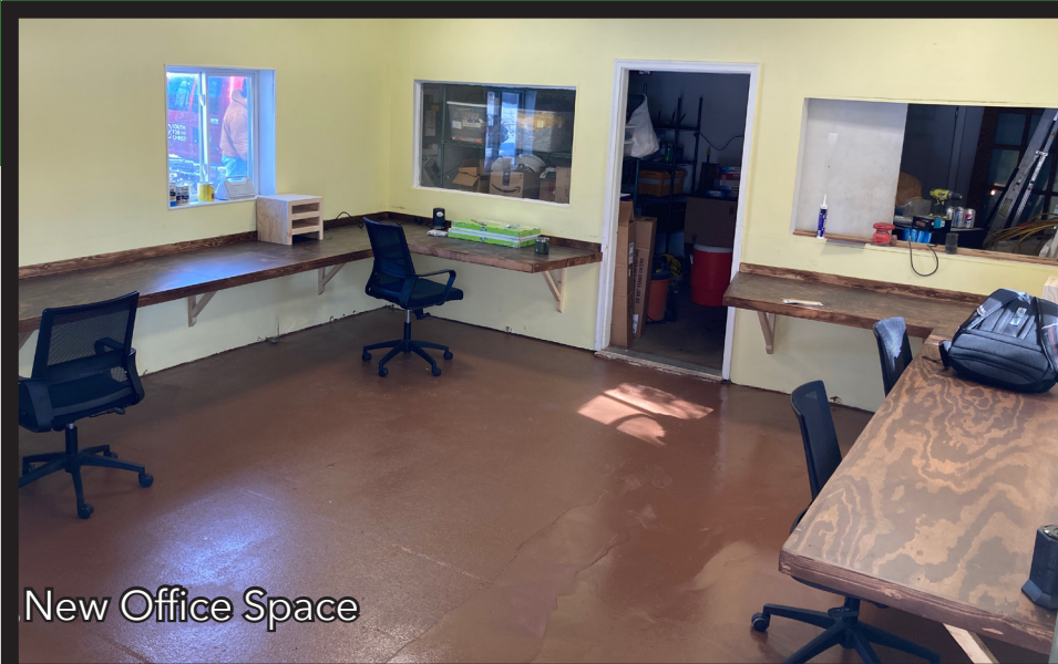
New Office Space