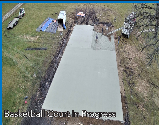
Basketball Court in Progress